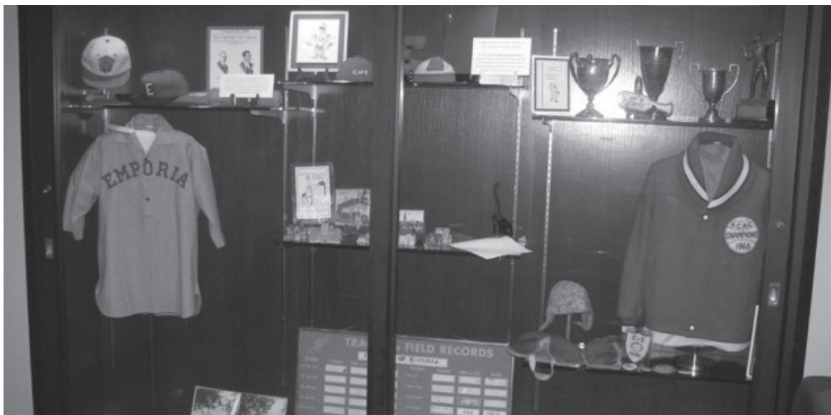
Display in the College of Emporia Room in the Sauder Alumni Center on the Emporia State University campus. The display is currently maintained by the Lyon County History Center.